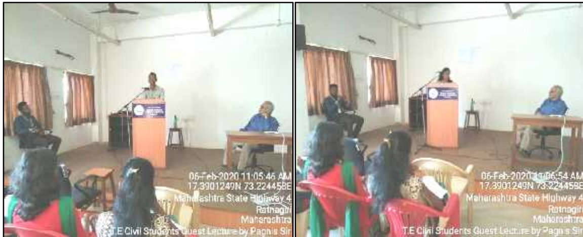
Students Sharing their feedback about the Guest Lecture